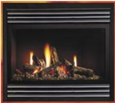
Unit illustrated is a ZDV3318N Zero Clearance Direct Vent Fireplace – Natural Gas, with LOGC50 Log Set, Z6GCR Grill Kit – Chrome.

LOGC50 Log Set – Seven Piece Classic Oak shown on the front of brochure.