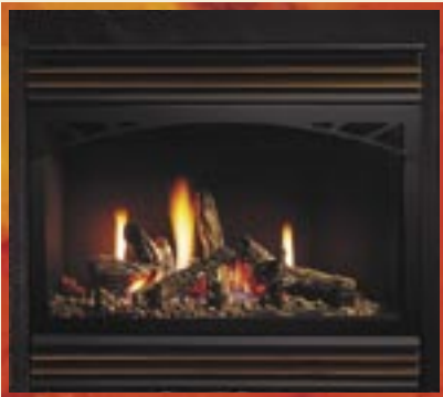
Unit illustrated is a ZDV3622N Zero Clearance Direct Vent Fireplace – Natural Gas, with LOGC50 Log Set, Z36GBP Grill Kit – Classic Polish Brass, Z36ADTH Designer Arch Door Top Half.